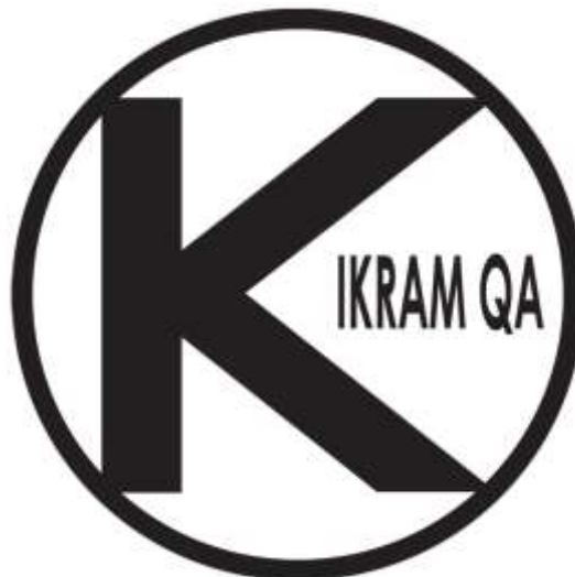
(a) The K-Mark where text located on the side

MS 1314: PART 1:1993 CERT. NO.: IKRAM-D002-C0101-N1401